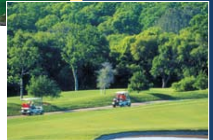
Serrano, El Dorado Hills, California