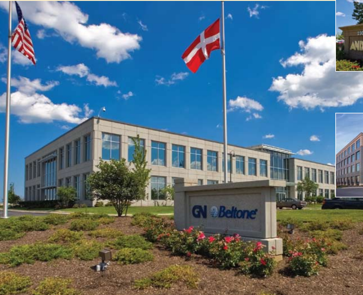
Beltone headquarters at Prairie Glen Corporate Campus, Glenview, Illinois