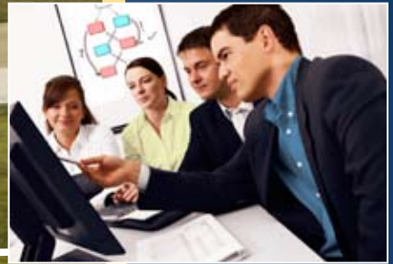
Airpark 599, Stockton, California